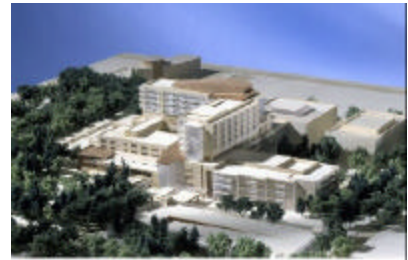
The Children's Hospital New Fitzsimons Campus Aurora, Colorado